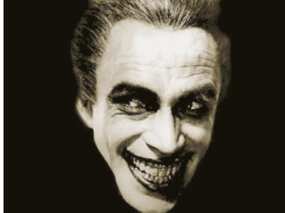
The Man Who Laughs

N.C. Museum of Art —Victor Hugo's novel The Man Who Laughs —like his more popular work The Hunchback of Notre Dame —is the tale of a gentle man trapped in the body of a monster. The 1928 silent film adaptation, directed by Paul Leni, will be shown as part of the N.C. Museum of Art's winter film series. The title character, Gwynplaine, is played by Conrad Veidt; his laughing man's perpetual smile, angular face and slicked back hair famously inspired Batman creators Bob Kane and Bill Finger in their design of Batman's arch-nemesis, The Joker.